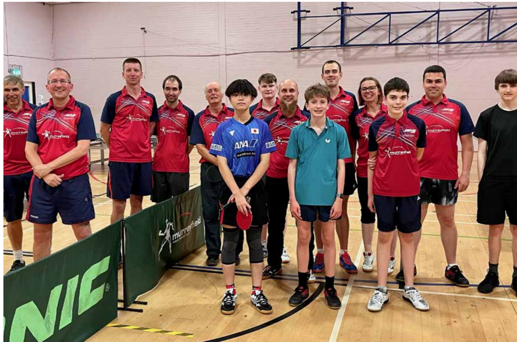
The Murrayfield players are all set for the new Edinburgh and Lothians