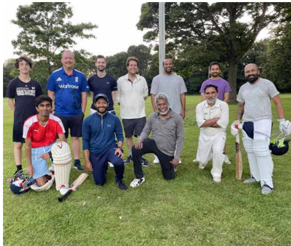
Edinburgh South 2nds won ten and lost only two of their 12 completed fixtures.