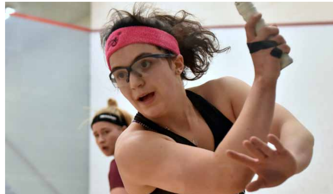
Georgia, above and below, will have her matches streamed on Scottish Squash's Facebook page https://bit.ly/3DT8eJ as well as u-tube channels.